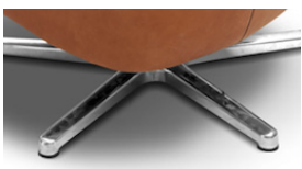
OPTION 1: STAINLESS STEEL BASE