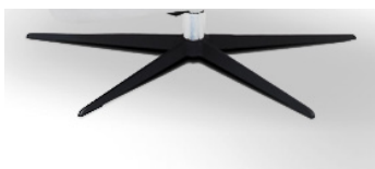
OPTION 2: STAINLESS STEEL BASE BLACK FINISH