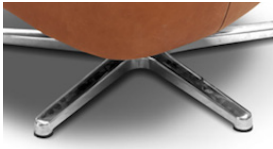
OPTION 1: STAINLESS STEEL BASE