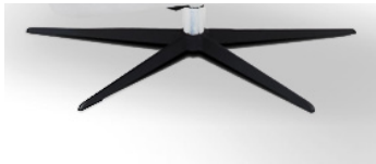
OPTION 2: STAINLESS STEEL BASE BLACK FINISH