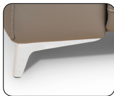
FOOT OPTION # 1: Stainless steel feet