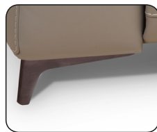
FOOT OPTION # 2: Metal feet smoked bronze fumè finish

Some versions may be equipped with hidden feet with a supporting structural function.