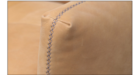
Special Stitch C