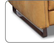
FEET OPTION 2: BRONZE FINISHING