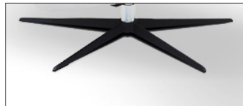
OPTION 2: STAINLESS STEEL BASE BLACK FINISH