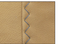
DECOR STITCH TYPE: A