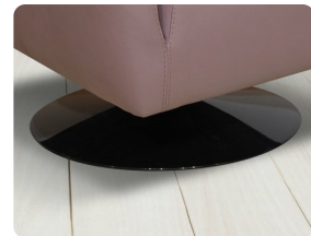
FOOT OPTION 2: STAINLESS STEEL BRONZE FINISH BASE