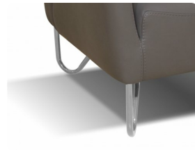
FOOT OPTION 3: STAINLESS STEEL FINISHING