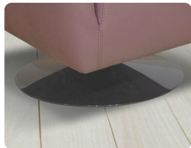
FOOT OPTION 1: STAINLESS STEEL FINISHING BASE