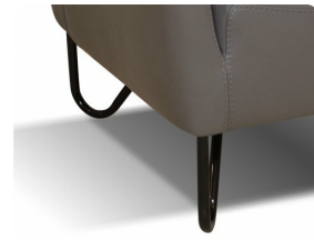
FOOT OPTION 4: METAL FEET BRONZE FINISH

LEATHER COLOR SHADE DIFFERENCES: The model upholstered with some Natural leather such as Maya, Emotion, Carees and Sensation, could present in some area differences in color tones of about 5%. Such differences are not to be considered defect but an expression of the natural characteristic of the cowhide. The company reserves the right without prior notice to make technical sheets changes and/or materials for quality product improvement. Leather sofas are a handmade product and according to the leather covering selected there could be a measurement tolerance of about 2 inches (cm 5) on each sku.