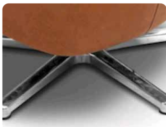
Foot Option 1: Stainless Steel Base