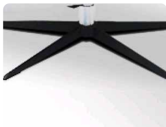
Foot Option 2: Stainless Steel Base Black Finish