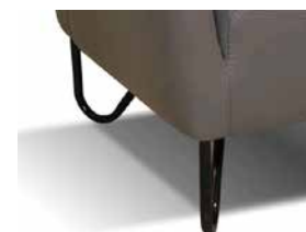
Foot Option 4: Stainless Steel Bronze Finish