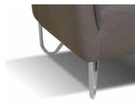
Foot Option 3: Stainless Steel Finish