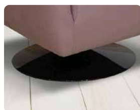
Foot Option 2: Stainless Steel Base Bronze Finish