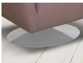
Foot Option 1: Stainless Steel Base Finish