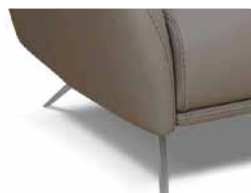
Foot Option 3: Stainless Steel Finish