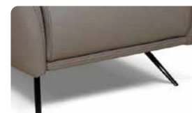
Foot Option 4: Stainless Steel Bronze Finish