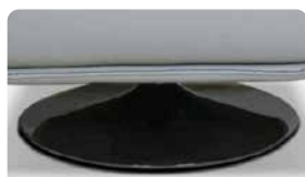
Foot Option 2: Stainless Steel Base Bronze Finish