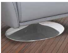
Foot Option 1: Stainless Steel Base Finish