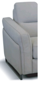
ARM TYPE 4: ADD + W 6" FOR EACH ARM