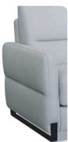
ARM TYPE 5: ADD + W 8" FOR EACH ARM