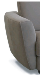
ARM TYPE 3: ADD + W 11" FOR EACH ARM