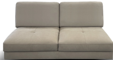
BODY TYPE C: Height 35"