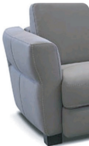
ARM TYPE 1: ADD + W 10" FOR EACH ARM