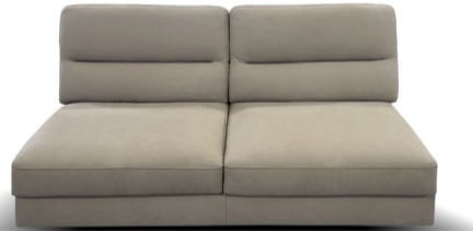
BODY TYPE B: Height 38"