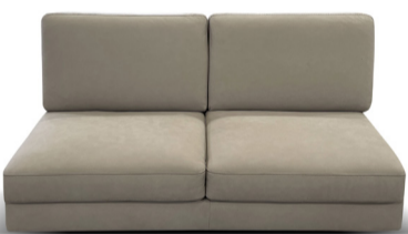
BODY TYPE A: Height 35"