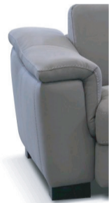
ARM TYPE 2: ADD + W 9" FOR EACH ARM