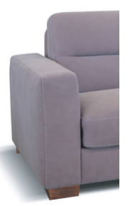
ARM TYPE 8: ADD + W 8" FOR EACH ARM

LEATHER COLOR SHADE DIFFERENCES: The model upholstered with some Natural leather such as Maya, Moss, Carees and Sensation, could present in some area differences in color tones of about 5%. Such differences are not to be considered defect but an expression of the natural characteristic of the cowhide. The company reserves the right without prior notice to make technical sheets changes and/or materials for quality product improvement. Leather sofas are a handmade product and according to the leather covering selected there could be a measurement tolerance of about 2 inches (cm 5) on each sku. REV. 002 DEL 14/03/2022 | Pag. 2 of 2