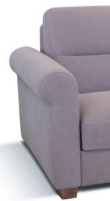
ARM TYPE 7: ADD + W 7" FOR EACH ARM