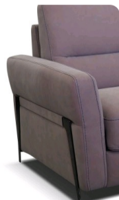
ARM TYPE 6: ADD + W 8" FOR EACH ARM