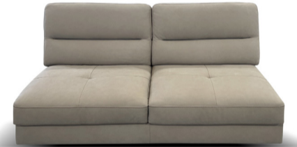
BODY TYPE D: Height 38"