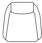
W 33" V100 ARMCHAIR