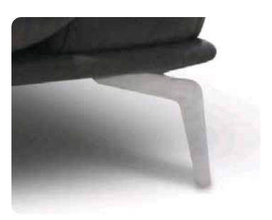
Foot Option 1: Stainless Steel Finish