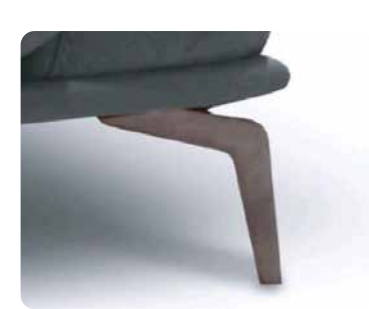
Foot Option 2: Stainless Steel Bronze Finish