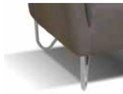
Foot Option 3: Stainless Steel Finish