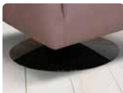
Foot Option 2: Stainless Steel Base Bronze Finish