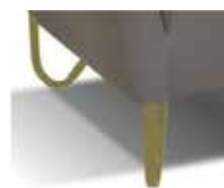
Foot Option 6: Stainless Steel Base Champagne Finish