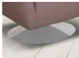
Foot Option 1: Stainless Steel Base Finish