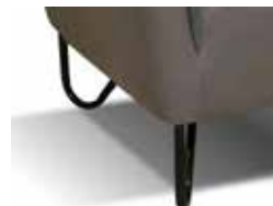
Foot Option 4: Stainless Steel Bronze Finish