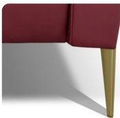
foot option 3: Feet in stainless steel champagne finish