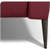
foot option 2: Feet in stainless steel bronze finish