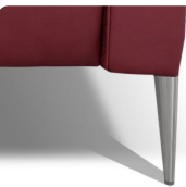
foot option 1: Feet in stainless steel finish