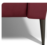
foot option 2: Feet in stainless steel bronze finish